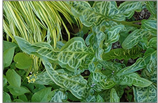
Italian Painted Arum foliage

Other Names: Cuckoo Pint, Lords-and-Ladies, Painted Arum