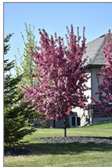
Thunderchild Flowering Crab in bloom

This tree will require occasional maintenance and upkeep, and is best pruned in late winter once the threat of extreme cold has passed. It has no significant negative characteristics.