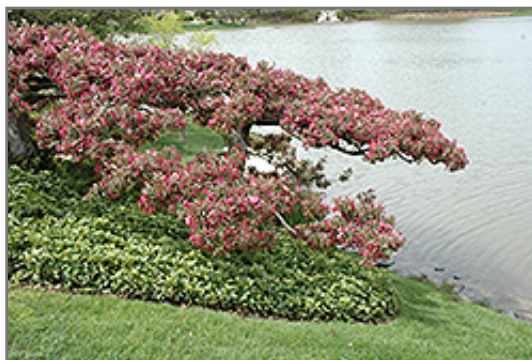
Candied Apple Flowering Crab in bloom