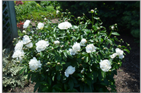
Festiva Maxima Peony in bloom