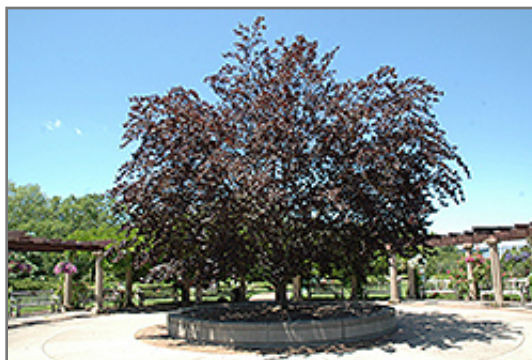
Purple Beech