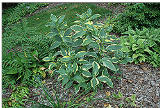
Lemon Wave Hydrangea