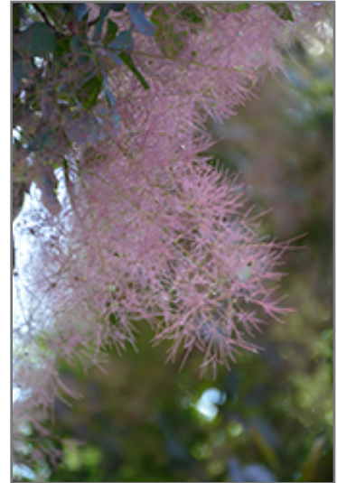
Royal Purple Smokebush flowers

This shrub should only be grown in full sunlight. It is very adaptable to both dry and moist locations, and should do just fine under average home landscape conditions. It is not particular as to soil type or pH. It is highly tolerant of urban pollution and will even thrive in inner city environments, and will benefit from being planted in a relatively sheltered location. This is a selected variety of a species not originally from North America.