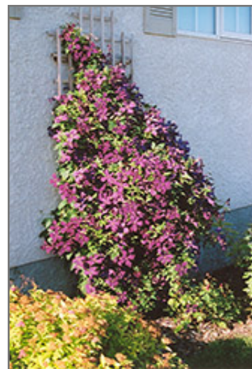
Polish Spirit Clematis in bloom