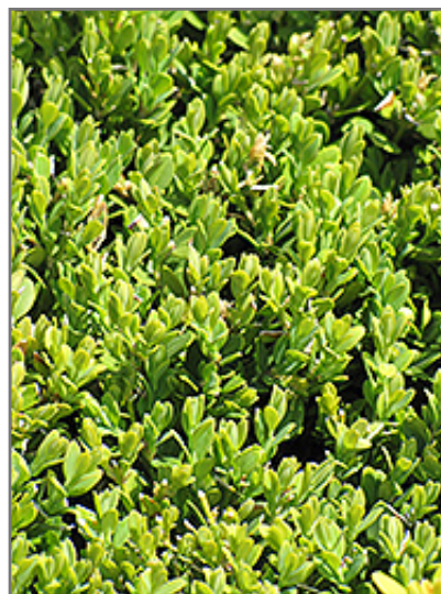
Compact Korean Boxwood foliage