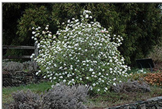
Koreanspice Viburnum in bloom

This is a relatively low maintenance shrub, and should only be pruned after flowering to avoid removing any of the current season's flowers. It is a good choice for attracting birds to your yard, but is not particularly attractive to deer who tend to leave it alone in favor of tastier treats. It has no significant negative characteristics.