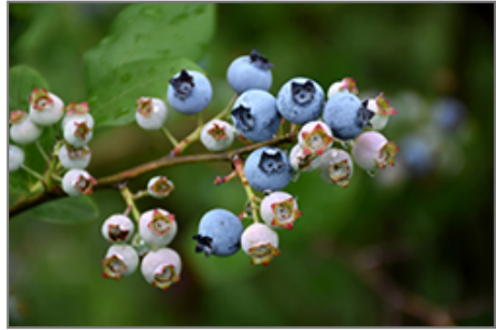
Highbush Blueberry fruit

This is a multi-stemmed deciduous shrub with an upright spreading habit of growth. Its average texture blends into the landscape, but can be balanced by one or two finer or coarser trees or shrubs for an effective composition. This is a relatively low maintenance plant, and usually looks its best without pruning, although it will tolerate pruning. It is a good choice for attracting birds to your yard. It has no significant negative characteristics.