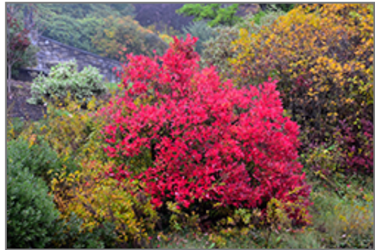
Highbush Blueberry in fall