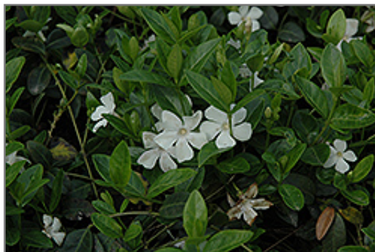
White Periwinkle flowers