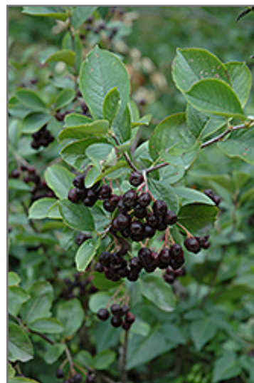
Black Chokeberry fruit