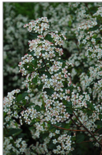
Black Chokeberry flowers