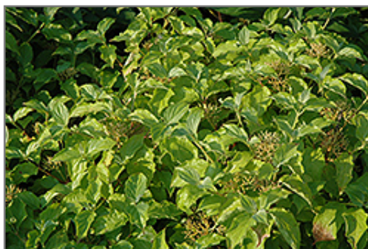
Arctic Sun Dogwood foliage