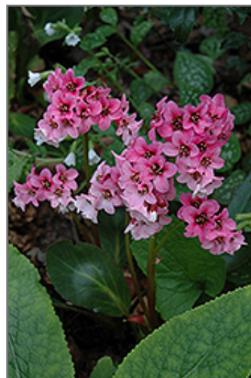
Pink Dragonfly Bergenia flowers