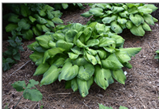
Guacamole Hosta