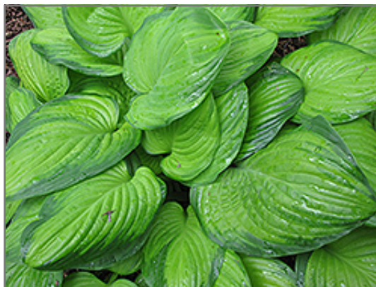
Guacamole Hosta foliage