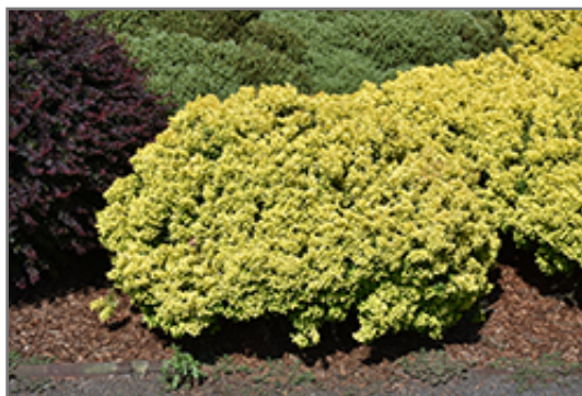
Golden Nugget Japanese Barberry