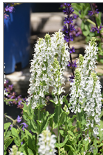
Snow Hill Sage flowers