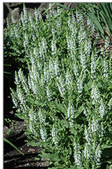
Snow Hill Sage in bloom

Snow Hill Sage is a fine choice for the garden, but it is also a good selection for planting in outdoor pots and containers. It is often used as a 'filler' in the 'spiller-thriller-filler' container combination, providing a mass of flowers against which the larger thriller plants stand out. Note that when growing plants in outdoor containers and baskets, they may require more frequent waterings than they would in the yard or garden.