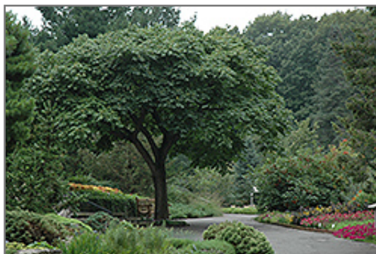
Amur Cork Tree