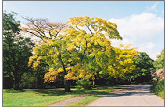
Amur Cork Tree in fall

This tree should only be grown in full sunlight. It is an amazingly adaptable plant, tolerating both dry conditions and even some standing water. It is not particular as to soil type or pH. It is somewhat tolerant of urban pollution. This species is not originally from North America.