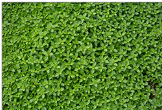
Creeping Thyme foliage