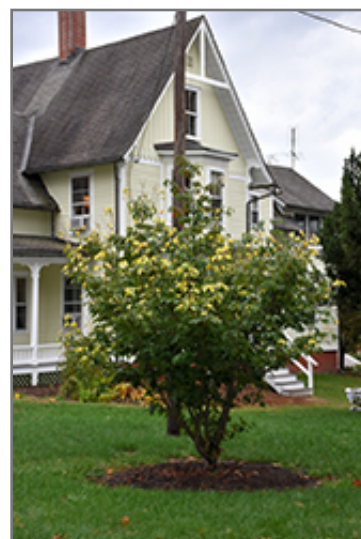
Champion's Gold Chinese Dogwood