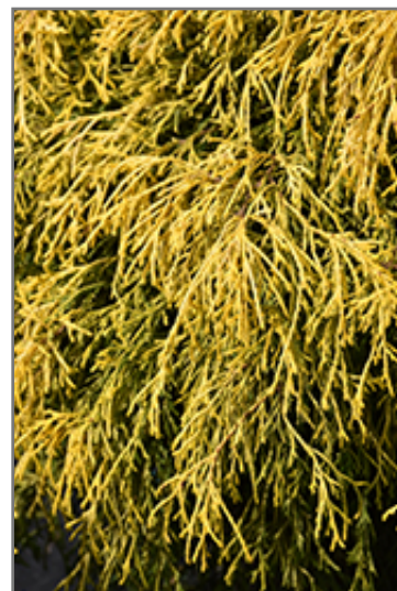
Paul's Gold Threadleaf Falsecypress foliage

Paul's Gold Threadleaf Falsecypress is recommended for the following landscape applications;