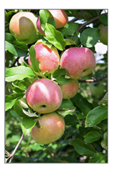
Northern Spy Apple fruit