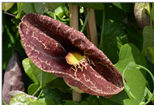
Giant Dutchman's Pipe flowers