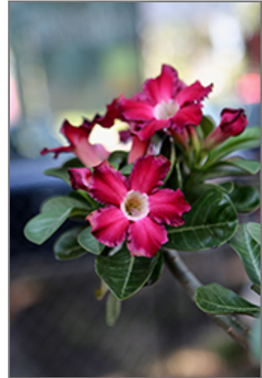
Desert Rose flowers