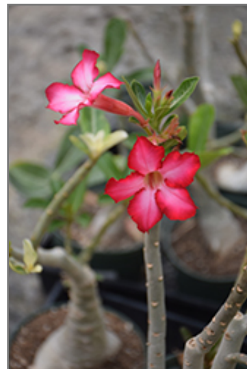
Desert Rose flowers