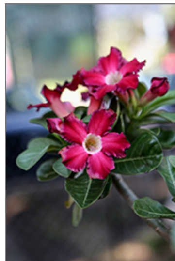
Desert Rose flowers