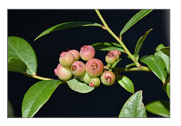
Pink Lemonade Blueberry fruit