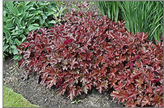
Chocolate Ruffles Coral Bells

This is a relatively low maintenance plant, and should be cut back in late fall in preparation for winter. It is a good choice for attracting hummingbirds to your yard. It has no significant negative characteristics.