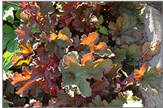
Chocolate Ruffles Coral Bells foliage

Chocolate Ruffles Coral Bells is a fine choice for the garden, but it is also a good selection for planting in outdoor pots and containers. With its upright habit of growth, it is best suited for use as a 'thriller' in the 'spiller-thriller-filler' container combination; plant it near the center of the pot, surrounded by smaller plants and those that spill over the edges. Note that when growing plants in outdoor containers and baskets, they may require more frequent waterings than they would in the yard or garden.