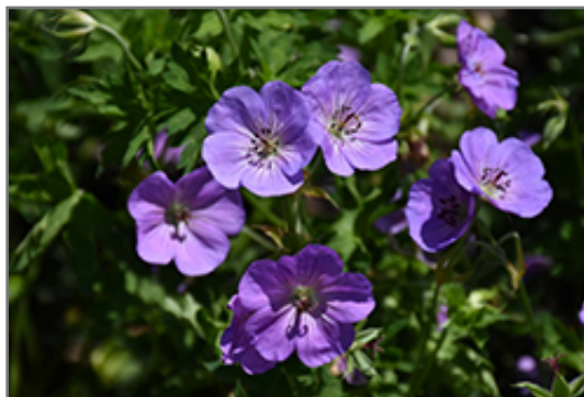
Azure Rush Cranesbill flowers