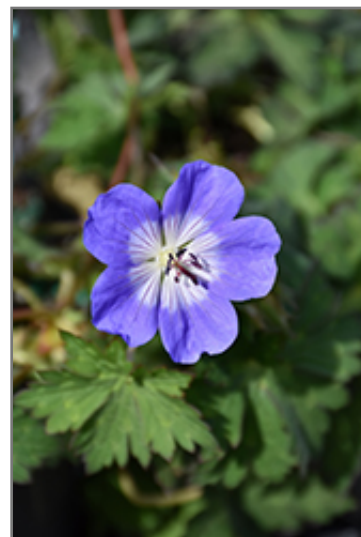
Azure Rush Cranesbill flowers

Azure Rush Cranesbill is recommended for the following landscape applications;