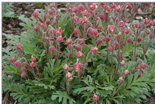
Prairie Smoke in bloom

This plant will require occasional maintenance and upkeep, and should be cut back in late fall in preparation for winter. It is a good choice for attracting butterflies to your yard, but is not particularly attractive to deer who tend to leave it alone in favor of tastier treats. Gardeners should be aware of the following characteristic(s) that may warrant special consideration;