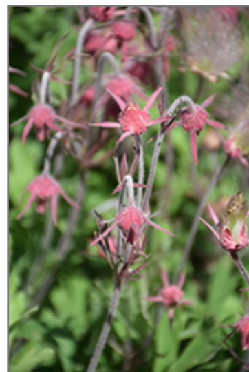
Prairie Smoke flower buds