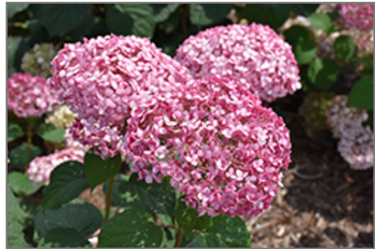
Invincibelle Spirit II Hydrangea flowers