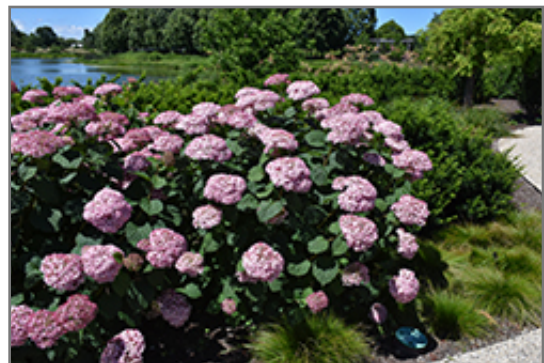
Invincibelle Spirit II Hydrangea in bloom