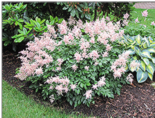
Peach Blossom Astilbe in bloom