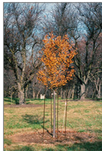
Lancelot Flowering Crab fruit