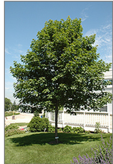
Fall Fiesta Sugar Maple

This tree should only be grown in full sunlight. It prefers to grow in average to moist conditions, and shouldn't be allowed to dry out. It is not particular as to soil pH, but grows best in rich soils. It is somewhat tolerant of urban pollution. This is a selection of a native North American species.