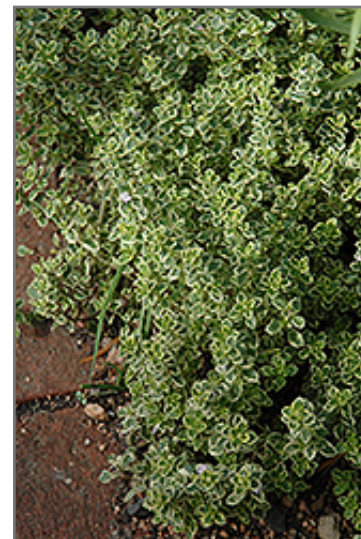
Aureus Lemon Thyme foliage