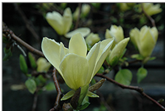
Golden Gift Magnolia flowers

Golden Gift Magnolia will grow to be about 25 feet tall at maturity, with a spread of 20 feet. It has a low canopy with a typical clearance of 2 feet from the ground, and is suitable for planting under power lines. It grows at a medium rate, and under ideal conditions can be expected to live for 50 years or more.