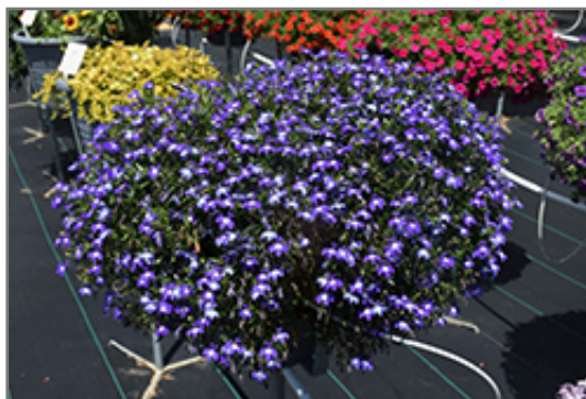
Magadi Compact Blue Plus Eye Lobelia in bloom