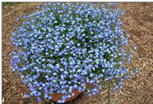
Bella Cielo Lobelia in bloom