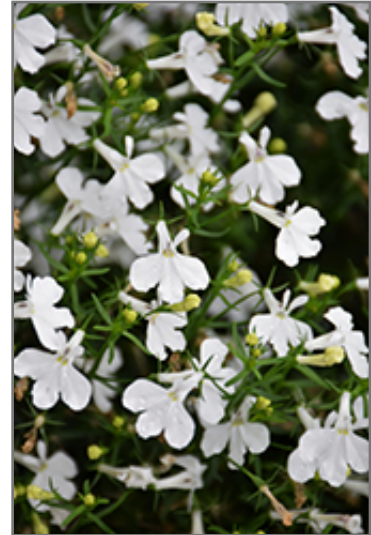
Bella Bianca Lobelia flowers