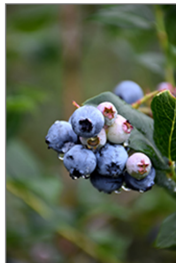
Chippewa Blueberry fruit

Chippewa Blueberry features dainty clusters of white bell-shaped flowers with shell pink overtones hanging below the branches in mid spring. It has green deciduous foliage. The glossy oval leaves turn an outstanding orange in the fall. It features an abundance of magnificent blue berries in mid summer.