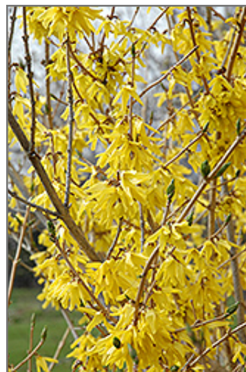
Northern Gold Forsythia flowers