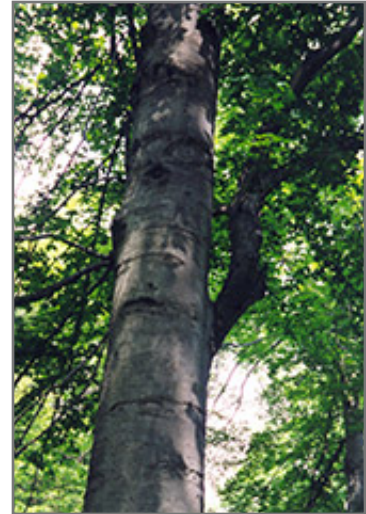
American Beech bark

This tree should only be grown in full sunlight. It requires an evenly moist well-drained soil for optimal growth, but will die in standing water. It is not particular as to soil pH, but grows best in rich soils. It is quite intolerant of urban pollution, therefore inner city or urban streetside plantings are best avoided, and will benefit from being planted in a relatively sheltered location. This species is native to parts of North America.