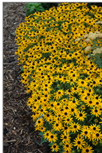
Little Goldstar Coneflower in bloom

Little Goldstar Coneflower is a fine choice for the garden, but it is also a good selection for planting in outdoor pots and containers. It is often used as a 'filler' in the 'spiller-thriller-filler' container combination, providing a mass of flowers against which the larger thriller plants stand out. Note that when growing plants in outdoor containers and baskets, they may require more frequent waterings than they would in the yard or garden.