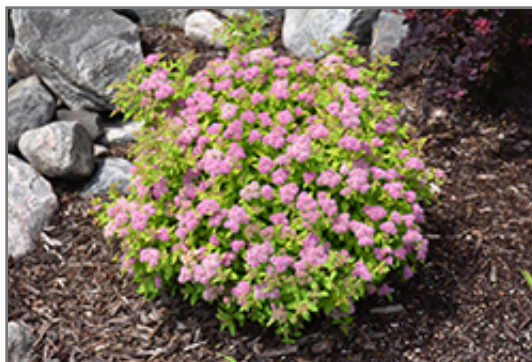
Dakota Goldcharm Spirea in bloom