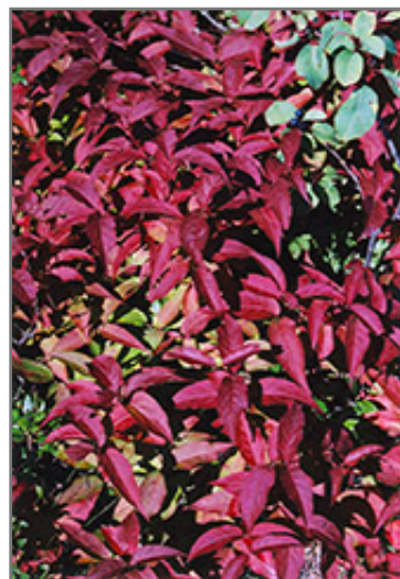
Bush Honeysuckle in fall

This shrub does best in full sun to partial shade. It is very adaptable to both dry and moist locations, and should do just fine under average home landscape conditions. It is not particular as to soil type or pH. It is highly tolerant of urban pollution and will even thrive in inner city environments. This species is native to parts of North America.