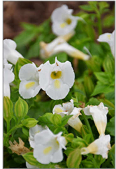
Catalina White Linen Torenia flowers