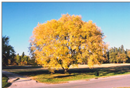
Boxelder in fall