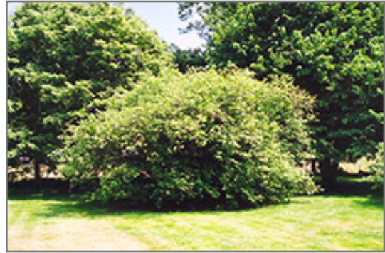
American Hazelnut

American Hazelnut will grow to be about 12 feet tall at maturity, with a spread of 8 feet. It tends to be a little leggy, with a typical clearance of 2 feet from the ground, and is suitable for planting under power lines. It grows at a medium rate, and under ideal conditions can be expected to live for approximately 30 years. While it is considered to be somewhat self-pollinating, it tends to set heavier quantities of fruit with a different variety of the same species growing nearby.