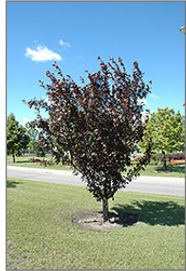
Thunderchild Flowering Crab

This tree should only be grown in full sunlight. It prefers to grow in average to moist conditions, and shouldn't be allowed to dry out. It is not particular as to soil type or pH. It is highly tolerant of urban pollution and will even thrive in inner city environments. This particular variety is an interspecific hybrid.