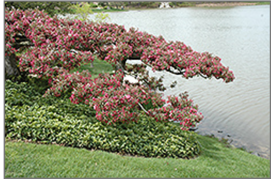
Candied Apple Flowering Crab in bloom