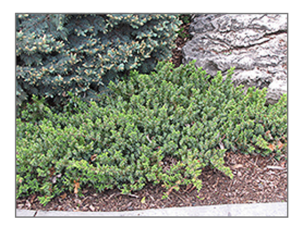
Dwarf Japanese Garden Juniper

This is a relatively low maintenance shrub, and is best pruned in late winter once the threat of extreme cold has passed. Deer don't particularly care for this plant and will usually leave it alone in favor of tastier treats. It has no significant negative characteristics.